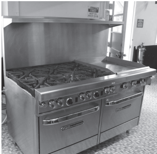
The new stove at the house.

By now you should have received the collegiate chapter's spring newsletter so I won't repeat their significant accomplishments for this year. Rather, I congratulate them! The Property Association has completed numerous improvement projects this year and more are planned. In addition to the new stove, refrigerator, windows and basement floor, we're planning on significant upgrades to the kitchen to support an in-house cook for the next academic year. These upgrades include a new dishwasher; repairs to the dishwasher exhaust; repairs to the detergent dispensing system; and new pots, pans, utensils, dishes, flatware and glassware. In addition, we are considering the purchase of a bin-type ice maker.