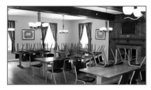
New lighting on the first floor.

Although there are many demands, we have no further plans for improvements at this