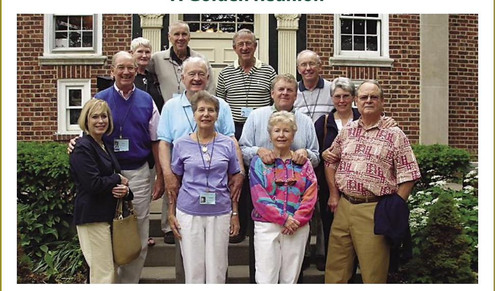
The Class of 1956 reunited in State College this summer for their 50th reunion.