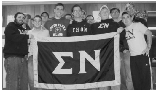
The Delta Delta

The Delta Delta Chapter of Sigma Nu held a retreat during the weekend of February 5-6 at the Hartman Center in Milroy, Pa. The focus of the retreat was on goal setting, visionary leadership and living our values. Goal setting is part of the