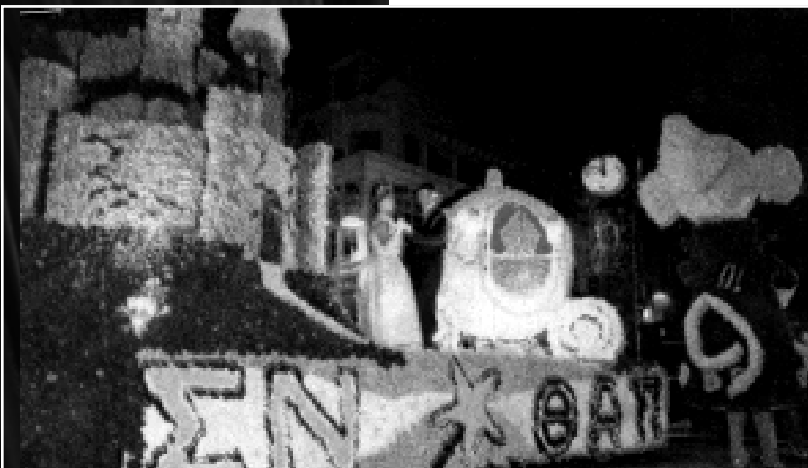
Sigma Nu and Theta Alpha Pi's winning float wows the crowd during Homecoming 1998.

1. Stop by the house and say hello: 340 North Burrowes Road, a place most of us called home during our Penn State years!